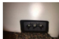
Prise type « WIELAND »