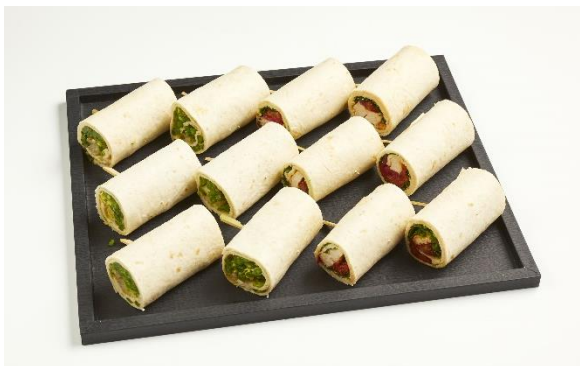
Tray of mackerel rilette mini-sandwiches