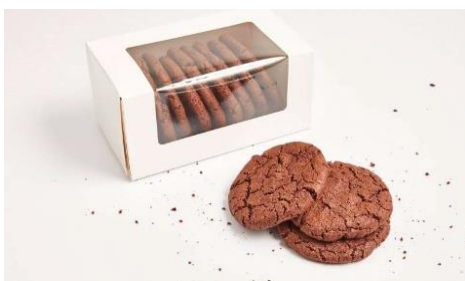
Chocolate cookies (8 items)