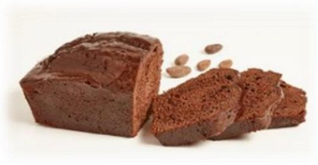
Chocolate cake (350g knife included)