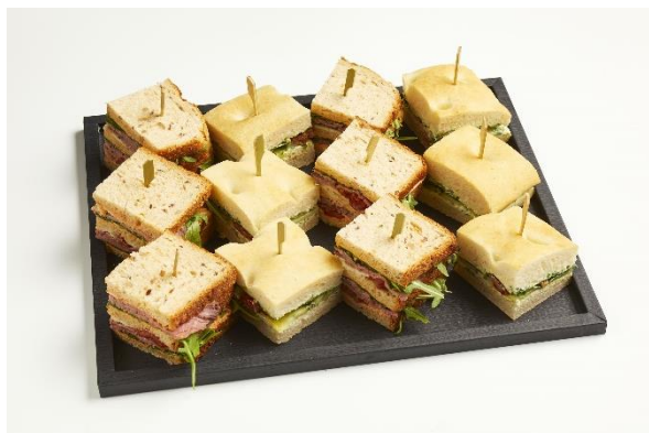
Tray of chicken and avocado mini-sandwiches