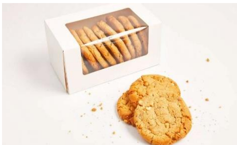
Chocolate milk and nuts cookies (8 items)