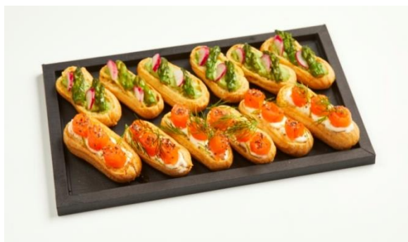
ASSORTMENT OF CLUB/FOCACCIA SANDWHICHES 12 pieces