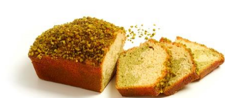
Lemon Poppy Seed Cake (350g including a knife)